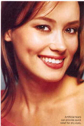
Artificial tears can provide quick relief for dry eyes.